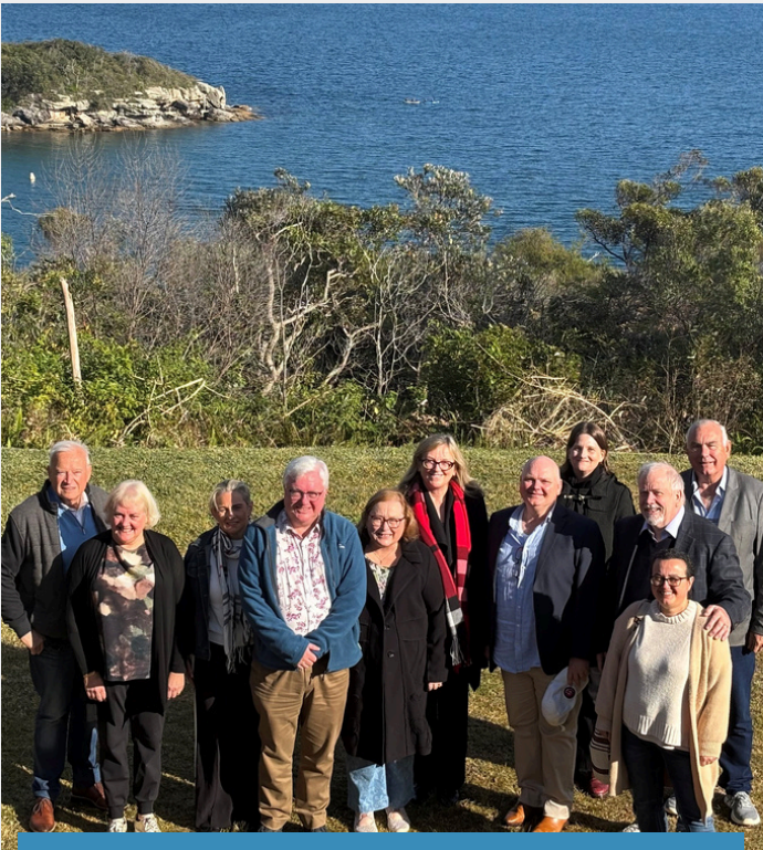
Governance Ministry Leadership Program 2025

The partnership with the Inclusive Governance in a Synodal Church Project will examine formation for lay people in decision-taking roles and map AMPJPs beyond Anglophone countries.